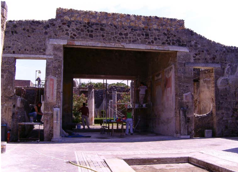
Caecilius' tablinum under restoration in 2008

The 2010 NACCP Summer Workshop offers Latin teachers the opportunity to explore the neighborhood of Lucius Caecilius Iucundus . With the Vesuvian International Institute in Castellammare di Stabia as host, Patricia Bell as guide, and NACCP teachers as instructors, the tour will include extensive visits to archaeological sites and museums in the Bay of Naples area, Cambridge Latin Course classroom sessions at the Institute, and networking among new and veteran Latin educators.